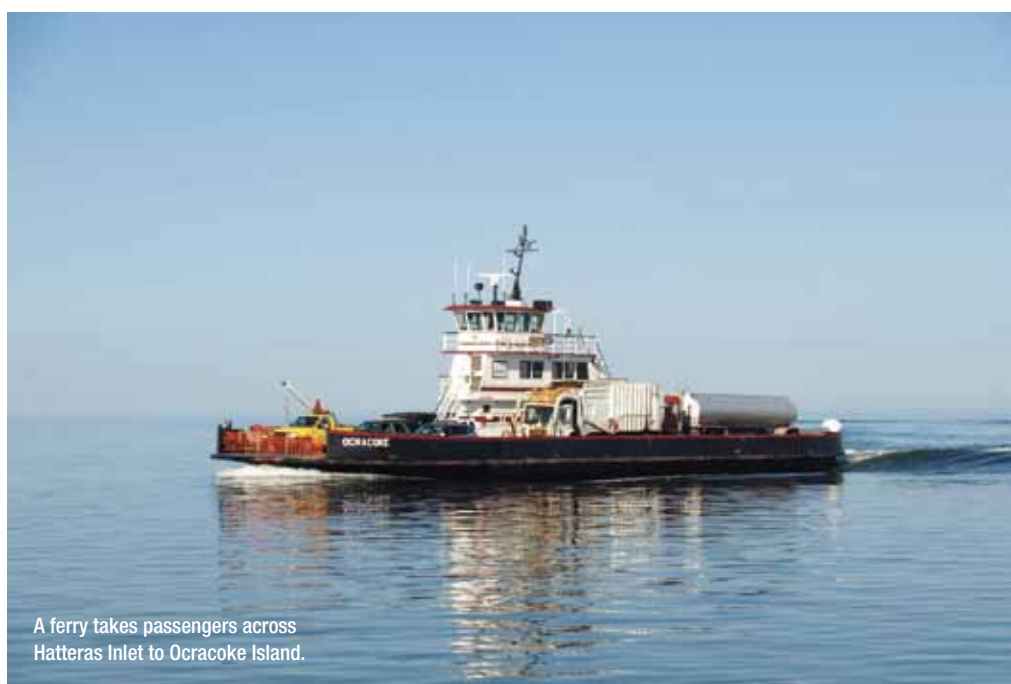
A ferry takes passengers across Hatteras Inlet to Ocracoke Island.