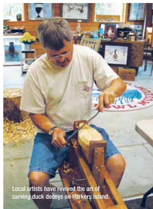
Local artists have revived the art of carving duck decoys on Harkers Island.