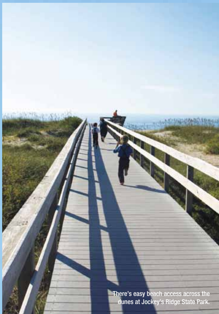
There's easy beach access across the dunes at Jockey's Ridge State Park.

The adventure begins with a turn off a busy interstate and onto the smaller routes tracing the coastline of the Carolinas. We have four days with nothing to do but slow down and touch the history, food, landmarks and people of small community life along the shoreline.