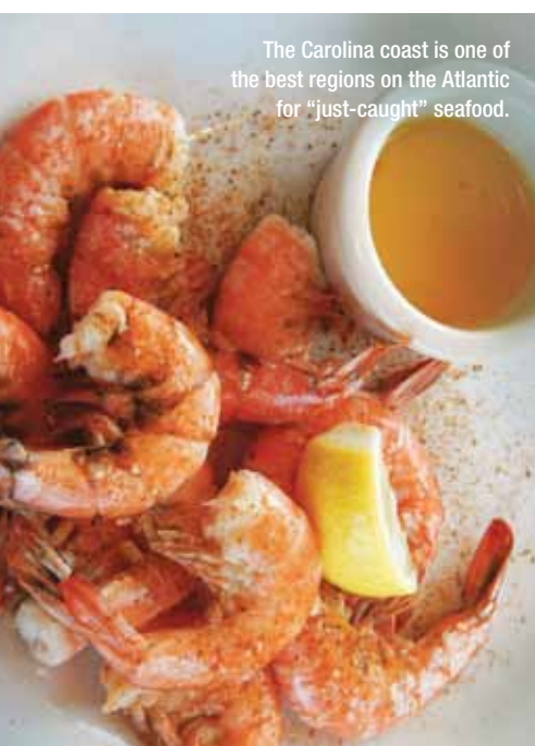
The Carolina coast is one of the best regions on the Atlantic for "just-caught" seafood.