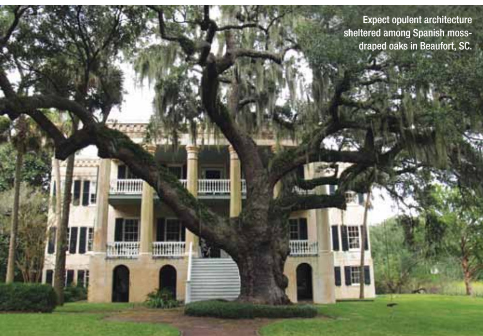
Expect opulent architecture sheltered among Spanish moss-draped oaks in Beaufort, SC.