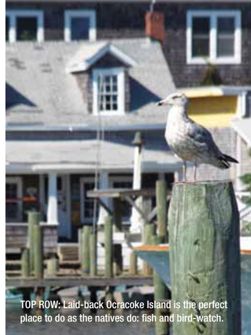
TOP ROW: Laid-back Ocracoke Island is the perfect place to do as the natives do: fish and bird-watch.