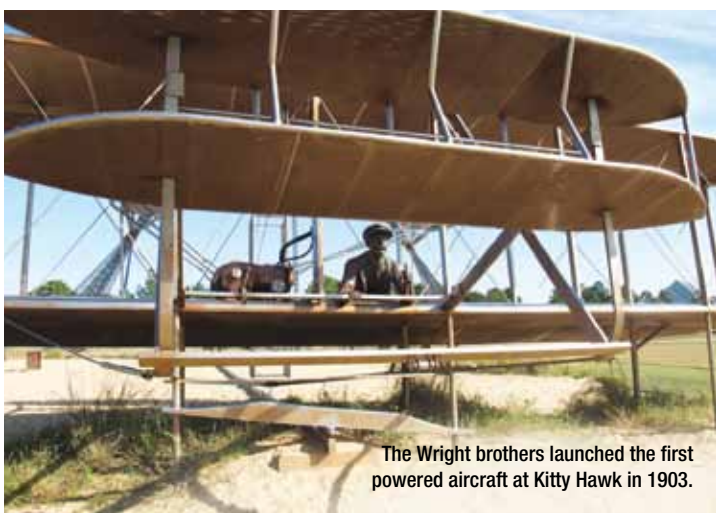
The Wright brothers launched the first powered aircraft at Kitty Hawk in 1903.