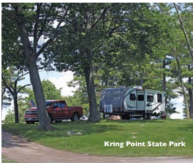
Kring Point State Park

Thousand Islands is getting out onto the St. Lawrence River, so at the town waterfront we rented kayaks from 1000 Islands Kayaking and explored some of the islands close to shore (we packed a picnic lunch and took along binoculars for a little birding). Just a few minutes north of town we hopped aboard a helicopter for a heart-stopping bird's-eye view of the islands. ( www.1000islandstourism.com )