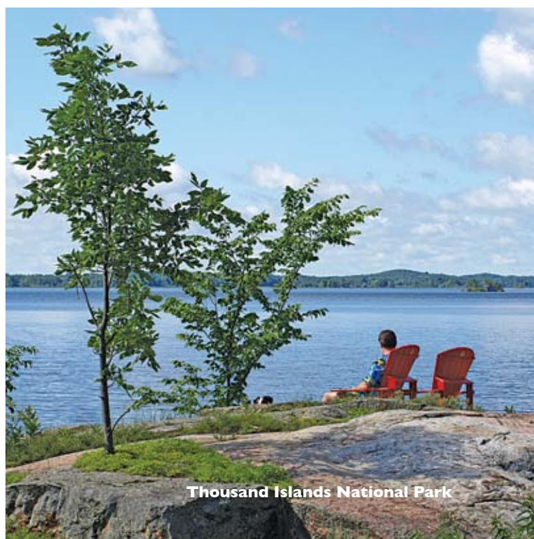
Thousand Islands National Park