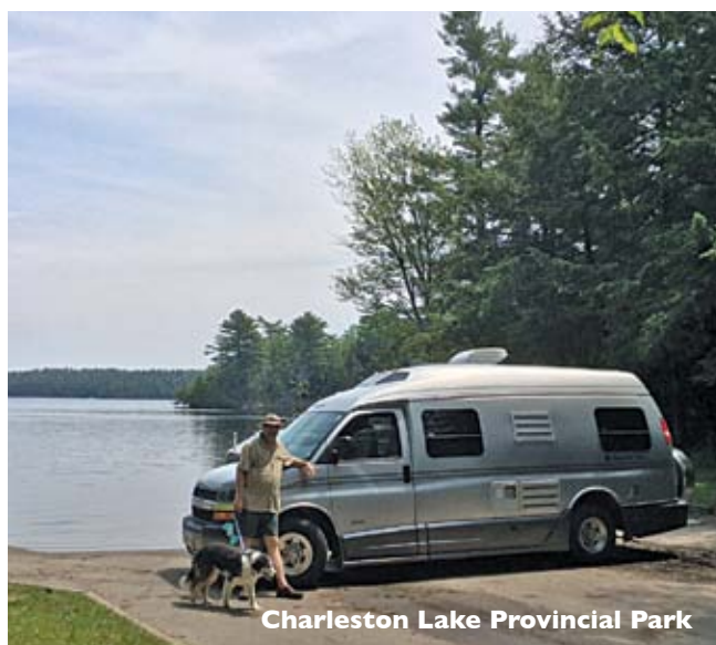
Charleston Lake Provincial Park

The geography is dominated by the Frontenac Arch Biosphere, a tree-blanketed, finger-like ridge of ancient granite that connects the rugged Canadian Shield to the Adirondack Mountains. This region has been recognized as a UNESCO World Biosphere Reserve, and has been nicknamed the "ancient backbone of North America" (to the Mohawk it's "The Bones of the Mother"). Long ago, successive glaciers eroded the mountaintops, compressing the landscape before finally melting. Once-towering peaks are now knobby outcrops of land surrounded by water: the Thousand Islands.