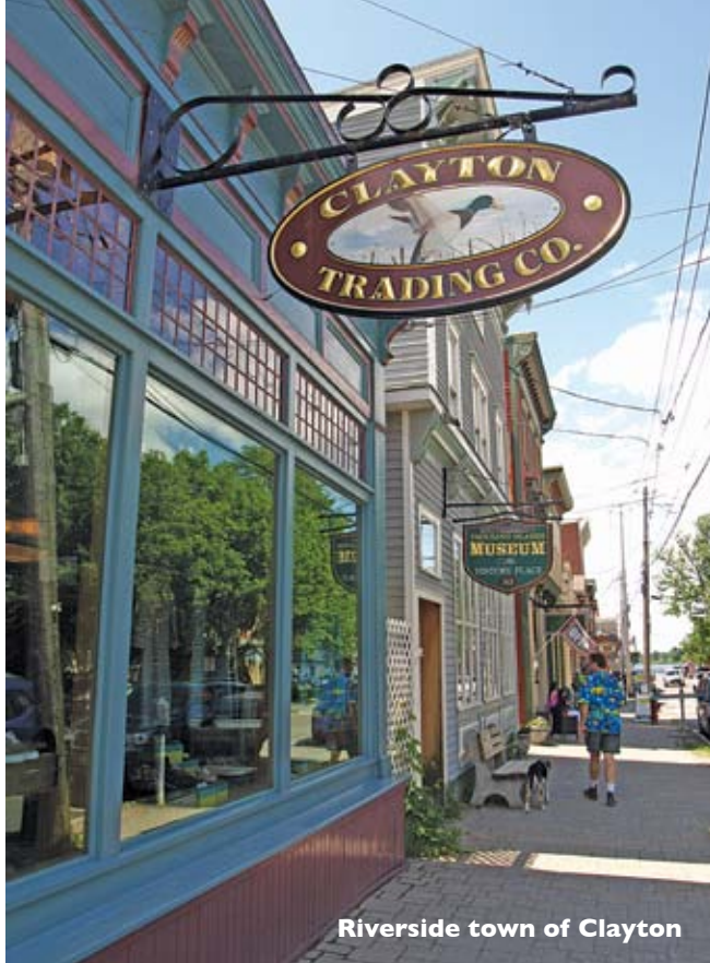
Riverside town of Clayton